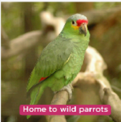
Home to wild parrots