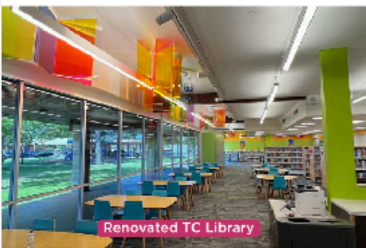
Renovated TC Library