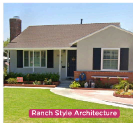
Ranch Style Architecture