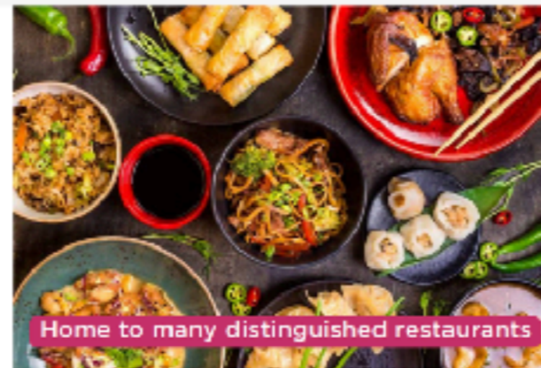
Home to many distinguished restaurants