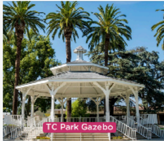
TC Park Gazebo