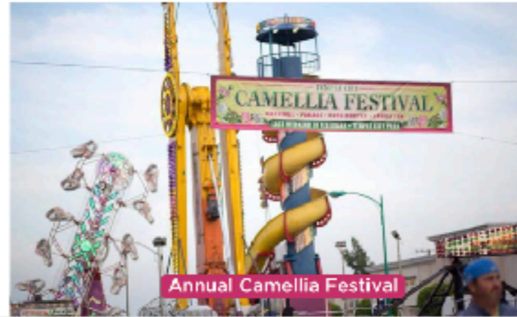
Annual Camellia Festival