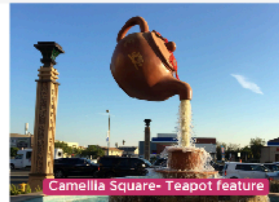
Camellia Square- Teapot feature